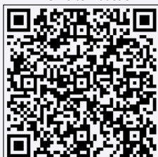
Prime X Site Induction